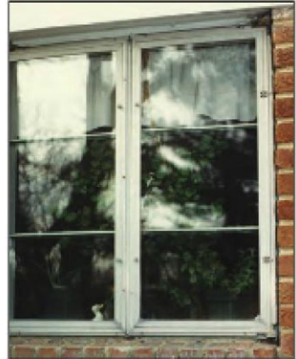
Vinyl Framed Windows can Make Clear Openings Smaller Requiring Permits

It is important to seek out the requirements in the location where your window client resides. You should be familiar with the local prevailing code affecting windows and doors to properly advise your client as to the proper product for each application.