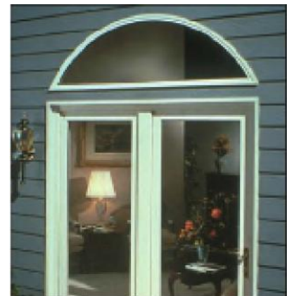
Safety Glass is Required Near Doors, Walkways and Stairways

Be sure you are familiar with all the local code requirements.