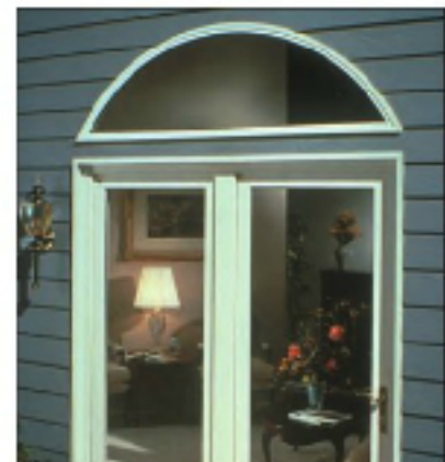
Safety Glass is Required Near Doors, Walkways and Stairways

Be sure you are familiar with all the local code requirements.