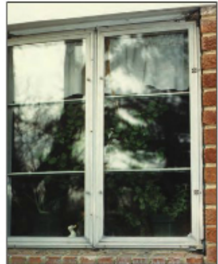
Vinyl Framed Windows can Make Clear Openings Smaller Requiring Permits

It is important to seek out the requirements in the location where your window client resides. You should be familiar with the local prevailing code affecting windows and doors to properly advise your client as to the proper product for each application.